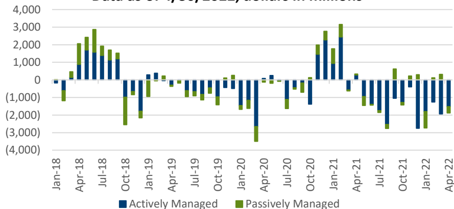
Data as of 4/30/2022, dollars in millions